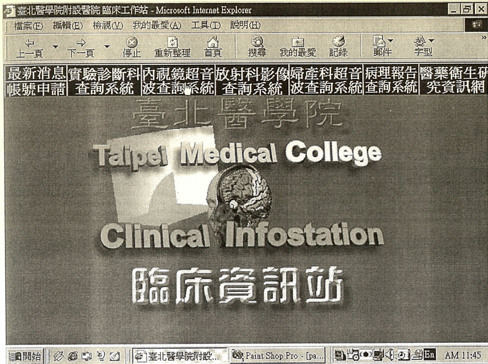
Fig. 2. Web site of the Clinical Infostation.