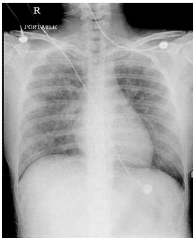
Fig. 2 Case 2 chest radiograph showing pulmonary edema.

Therefore, in Case 1, irrigation pressure during hysteroscopy was 200 mmHg and in Case 2, it was 150 mmHg.