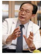
Portrait of a man in a white coat, likely a hospital official.

Medical professionals in a laboratory setting. Medical professionals in a laboratory setting. Medical professionals in a laboratory setting.