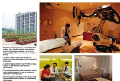
Interior view of the Wan Fang Medical Center showing medical equipment and staff.

With the medical tourism industry soaring to new heights, Taiwan's Wan Fang Medical Center looks to provide top-notch medical consultations and services for all patients that are looking for any kind of medical care.