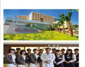
Exterior view of Shuang-Ho Hospital building.

Portrait of a man in a white coat, likely the hospital director. Portrait of a man in a white coat, likely the hospital director. Portrait of a man in a white coat, likely the hospital director.