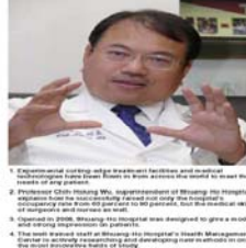
Portrait of a man in a white coat, likely the hospital director.

With 40 clinical departments, the new medical facility is a regional center for critical care and medical services for local and foreign patients alike.