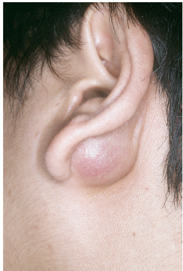
Figure 1 The tumor, which showed a smooth surface with brown color, was located at the left postauricular region.

neck (15%-20%), and lower extremities (15%). 2 Interestingly, nodular fasciitis is even more rarely found in the auricular region. Thompson et al 3 have done a retrospective study of 50 cases of auricular nodular fasciitis. They observed various commonalities in disease symptoms and pathology among nodular fasciitis patients. Their study included 22 female and 28 male subjects, ranging from ages 1 to 76 years with a mean of 27.4 years. Ninety-eight percent of patients had a mass lesion. Tumor size ranged